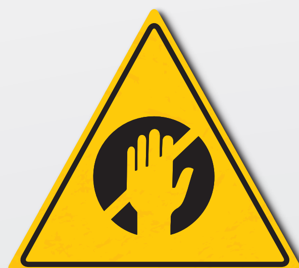
Be aware of objects, fabrics ... which can get caught in the machine