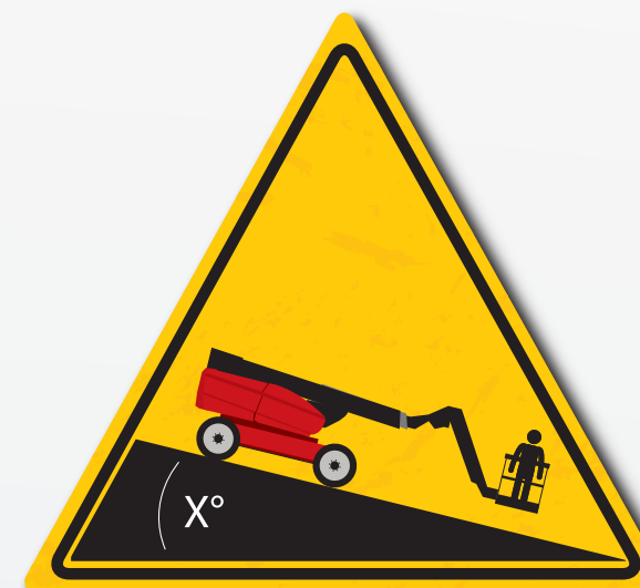
Be aware of load Gradeability