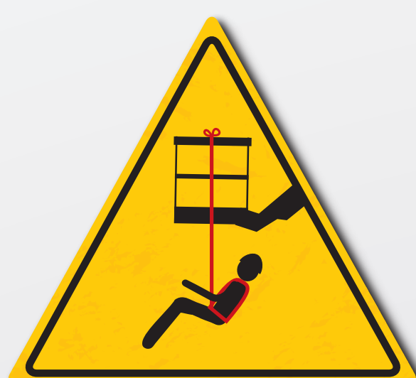
Always use a safety harness