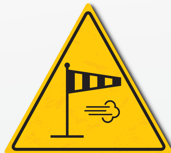
Make sure that the wind speed does not exceed 45 km/h