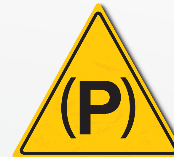
When parking respect safety rules