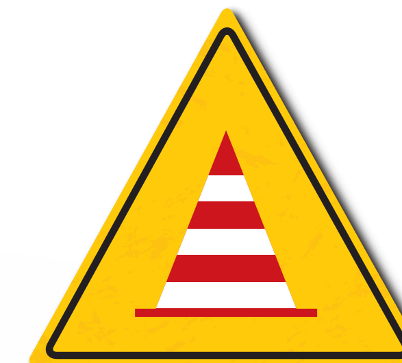
Define your work area with cones, barriers ...