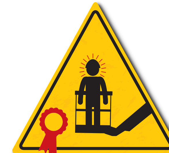
Only authorized persons may use the equipment