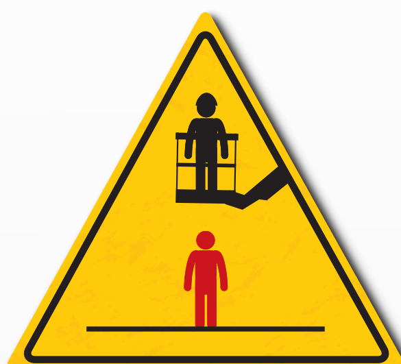
Never walk under a raised load