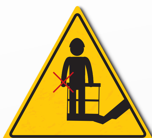
Never place your arms, legs ... outside the basket