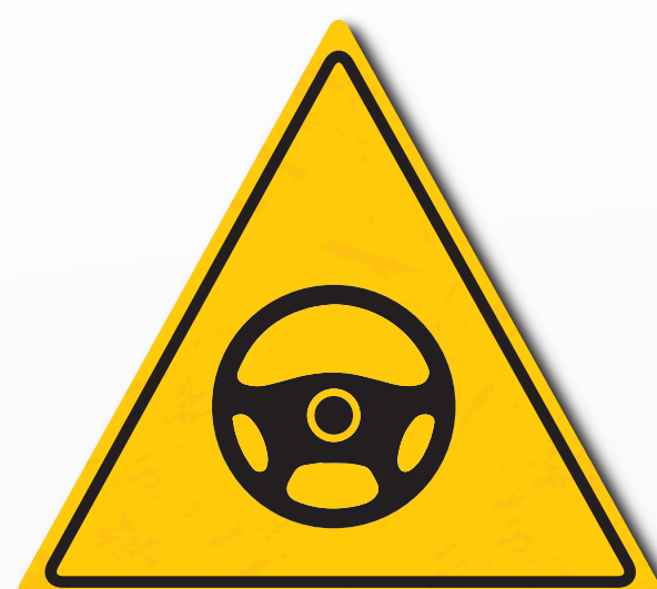
Adapt your driving mode to your environment