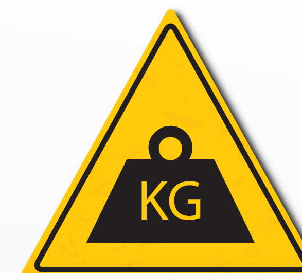
Respect the maximum capacity indicated on the load chart