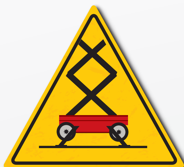
Be attentive ground conditions, when deploying stabilizers