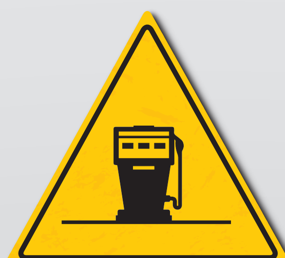
Be careful when refueling