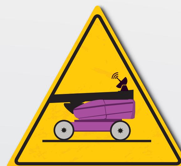
Never make unauthorized modifications to on your machine