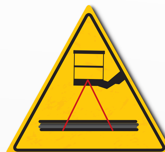
Never use the platform like a crane