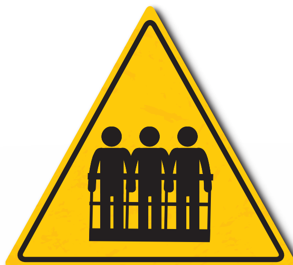
Respect the number of authorized persons in basket