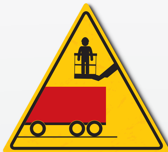
Pay attention to the position and the extension boom on the public highway