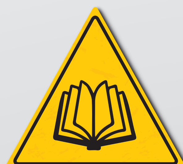
Read the instructions in the operator's manual