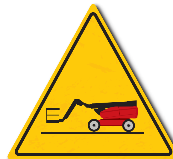
Check your equipment before use

Handling equipment is a lever improving working conditions when used properly. The Manitou Group wishes, through its REDUCE Risks program will inform you and you raise awareness of good practices for the safe use of your equipment.