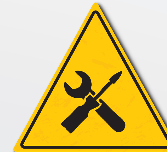
Periodic maintenance must comply with legal requirements