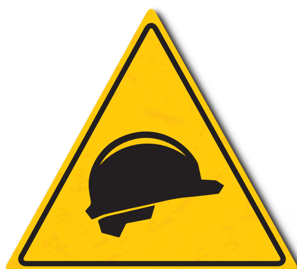
Adjust your PPE to suit your activity (helmets, glasses ...)