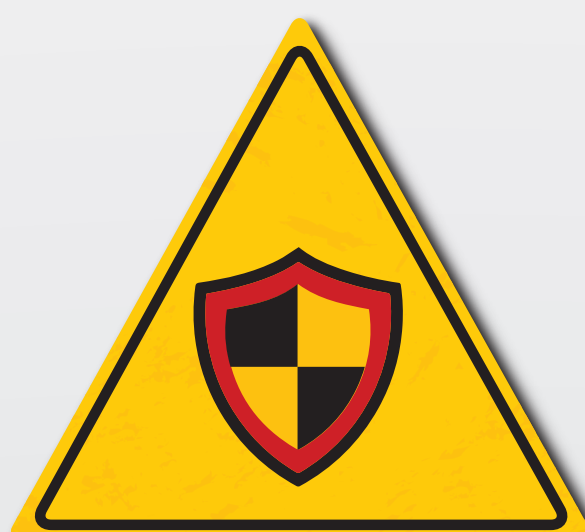
Never cut protection and safety systems