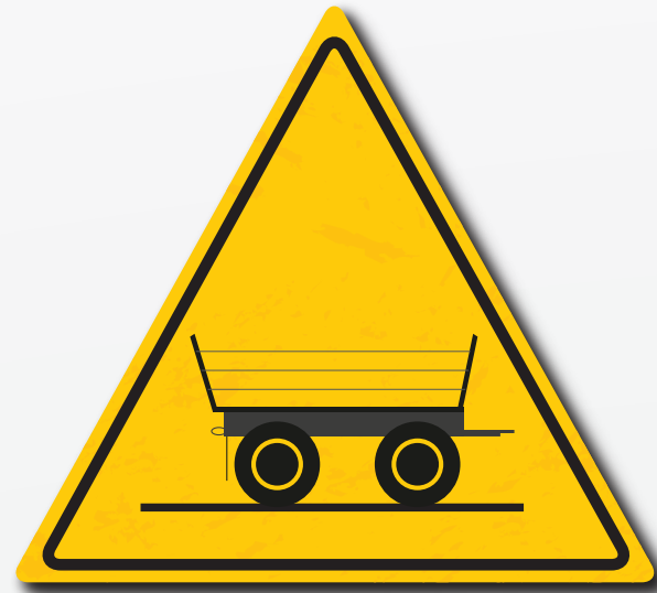
Be aware of legal requirements when you use a trailer