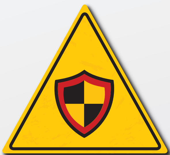
Never cut protection and safety systems