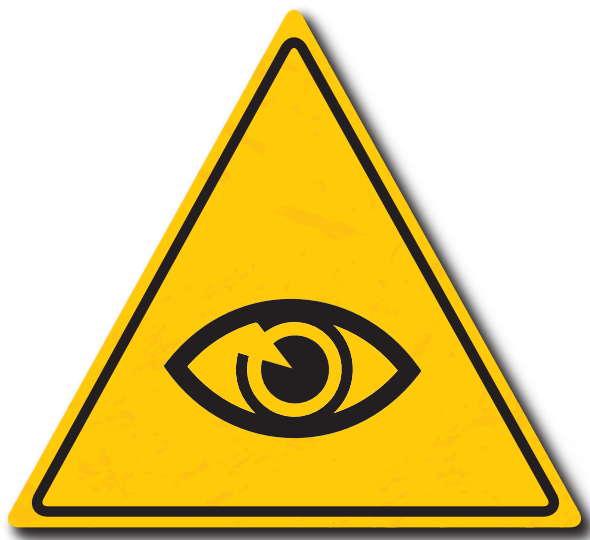
Make sure the correct driving position is selected