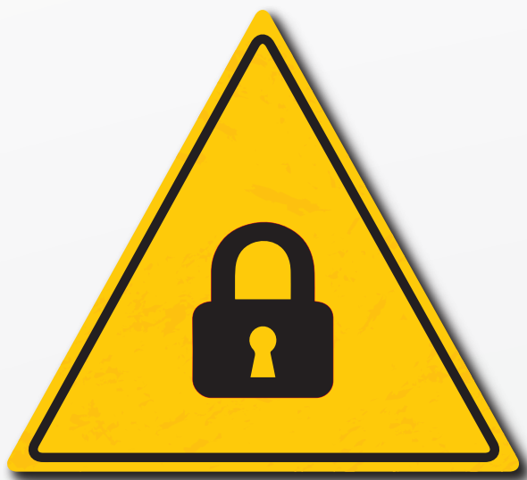
Make sure you use the correct fixing for your accessory