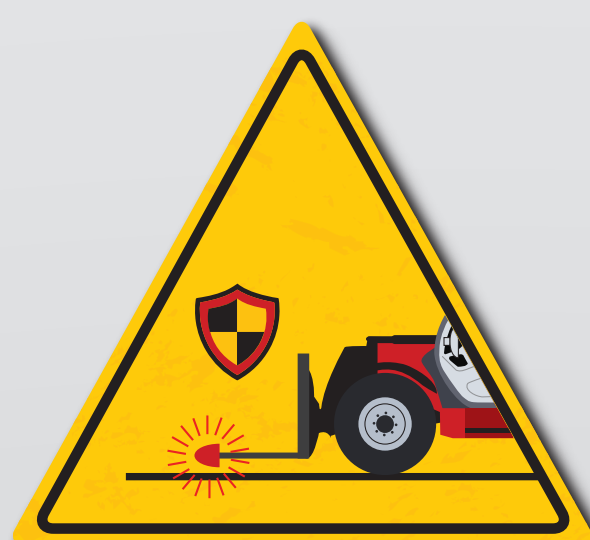
Protect all protruding accessories for road travel