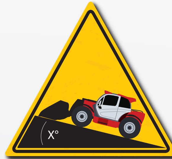
Be aware of load Gradeability