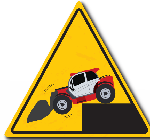
Keep a safe distance when approaching hazardous areas