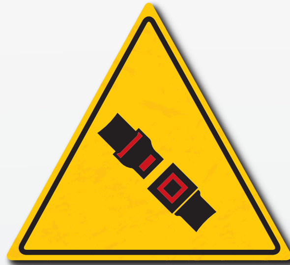
when you use your equipment the safety belts are mandatory