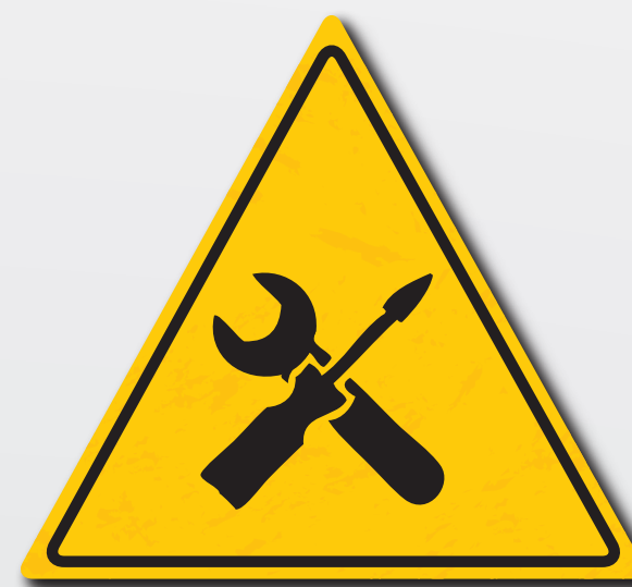
Periodic maintenance must comply with legal requirements