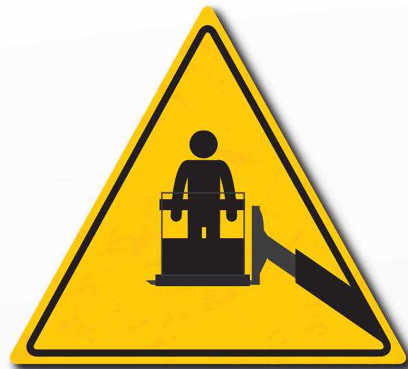
The elevation of persons is only permitted with suitable and certified platforms