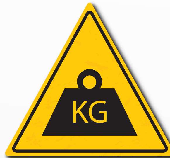
Respect the maximum capacity indicated on the load chart