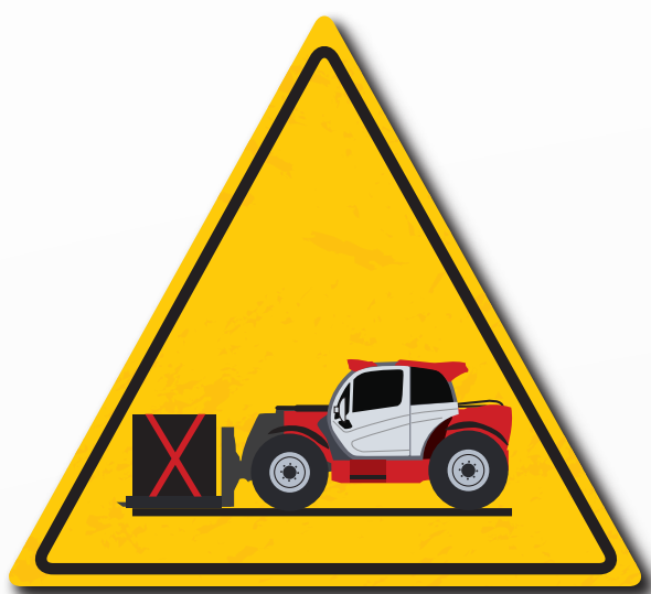
Carry the load in low position and the boom Retracted