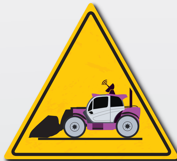
Never make unauthorized modifications to your equipment