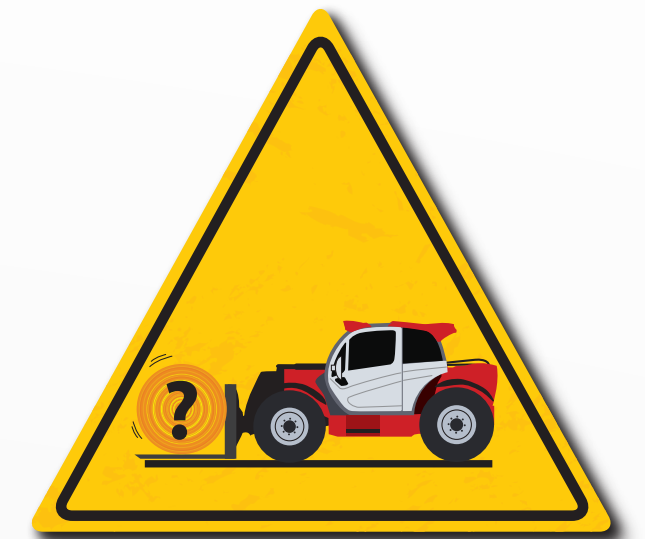
Use appropriate accessories according to the load requirement