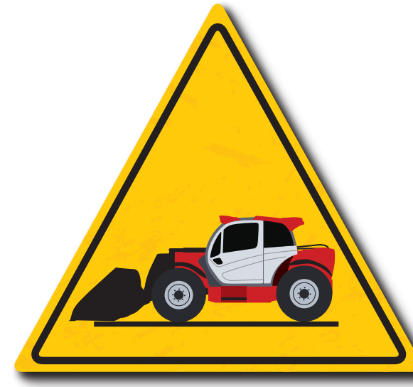
Check your equipment before use

Handling equipment is a lever improving working conditions when used properly. The Manitou Group wishes, through its REDUCE Risks program will inform you and you raise awareness of good practices for the safe use of your equipment.