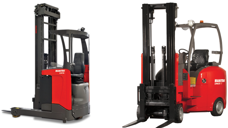
ER & EMA Models Our ER and EMA ranges are built for your most intensive logistics needs by providing unmatched compactness in narrow aisles and lift heights up to 12 meters.