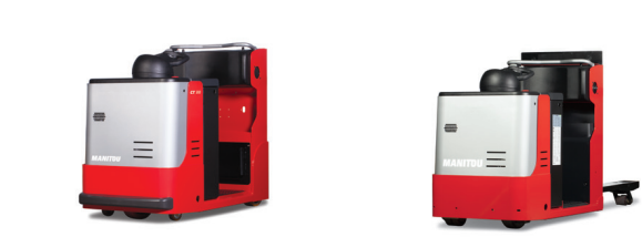
CT Model Tow from 3 to 5 tons.