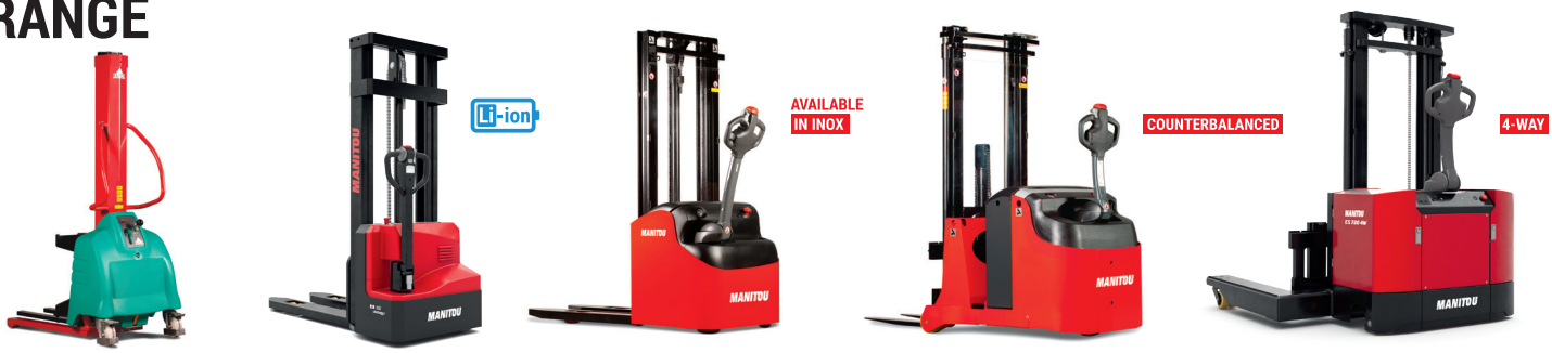
ES Model Wide range of stackers up to 3 tons capacity to answer all your requests. The counterbalanced version will give you optimised solutions for all kind of loads.