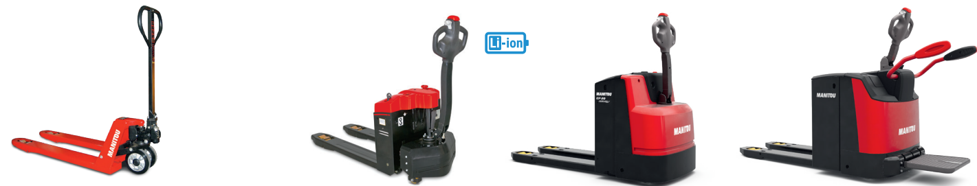
EH Model Manual pallet truck for basic daily transfer.