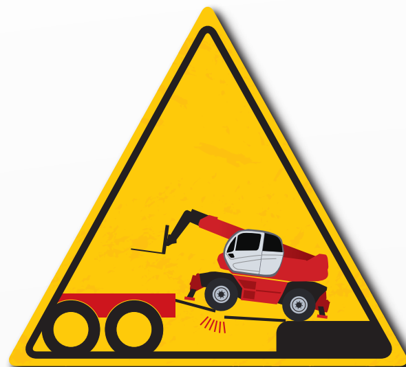
Always check the capacity of the loading area