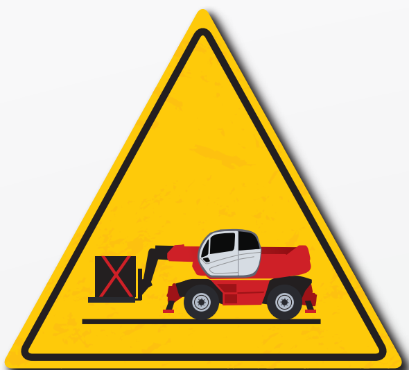
Carry the load in low position and the boom Retracted