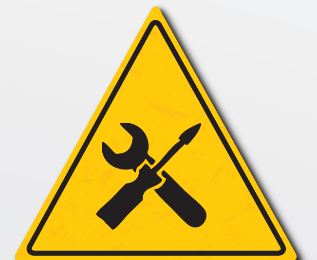
Periodic maintenance must comply with legal requirements