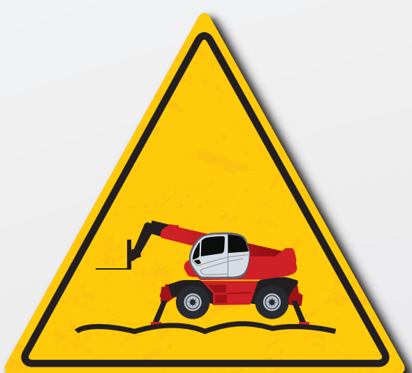
Be attentive to the ground conditions when deploying stabilizers