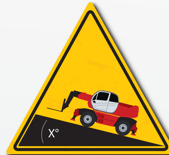
Be aware of load Gradeability