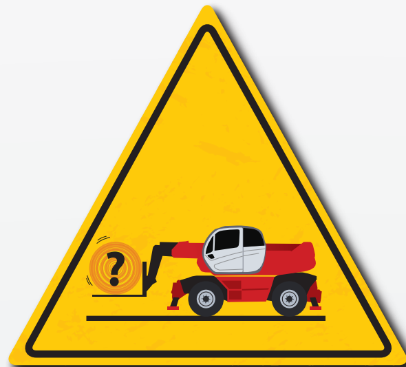
Use appropriate accessories according to the load requirement