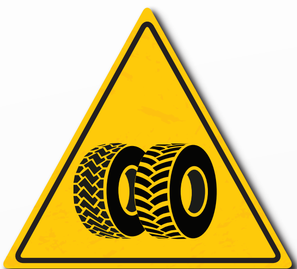
Adapt your tyres according to the type of ground