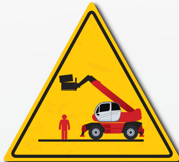
Never walk under a raised load