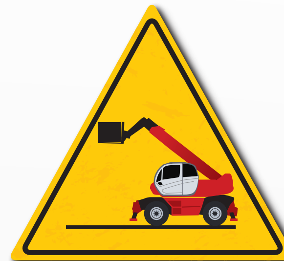
Don't leave the equipment static with a raised load