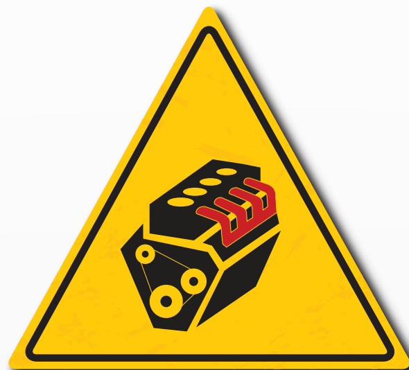
Never leave the engine running without driver