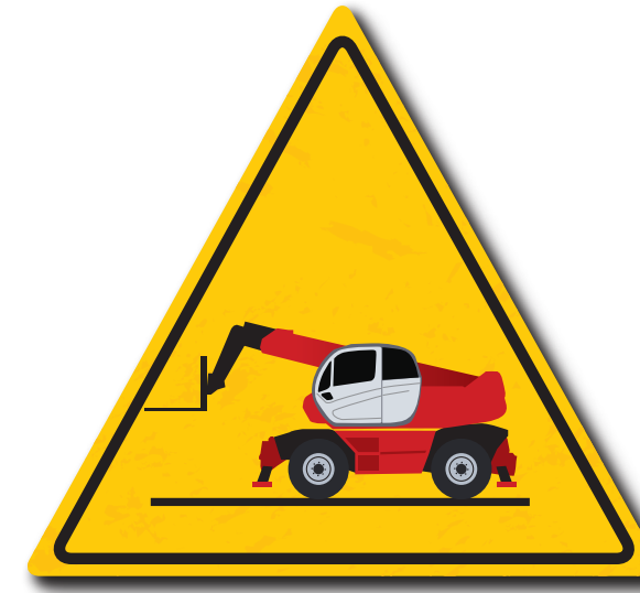
Check your equipment before use

Handling equipment is a lever improving working conditions when used properly. The Manitou Group wishes, through its REDUCE Risks program will inform you and you raise awareness of good practices for the safe use of your equipment.