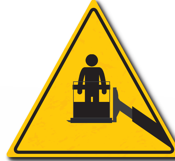
The elevation of persons is only permitted with suitable and certified platforms