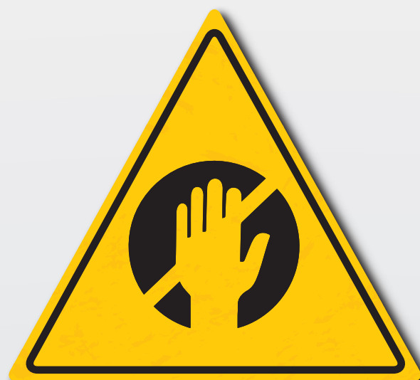
Be aware of objects, fabrics ... which can get caught in the machine.