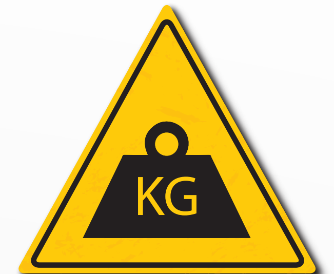
Respect the maximum capacity indicated on the load chart