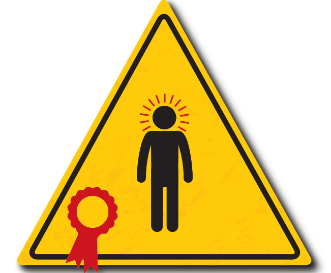
Only authorized persons may use the equipment