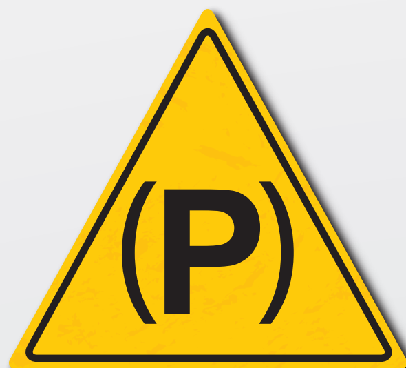
When parking respect safety rules