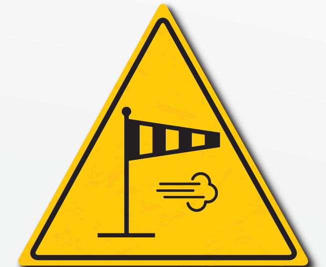
Make sure that the wind speed does not exceed 27mph