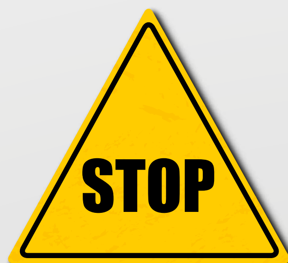
In an emergency press the emergency stop