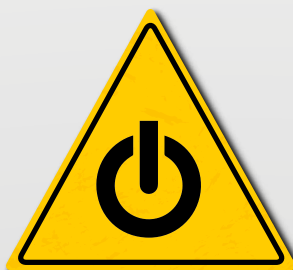
After use, always switch off the equipment