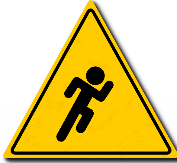
Be prepared to react to any unexpected situation