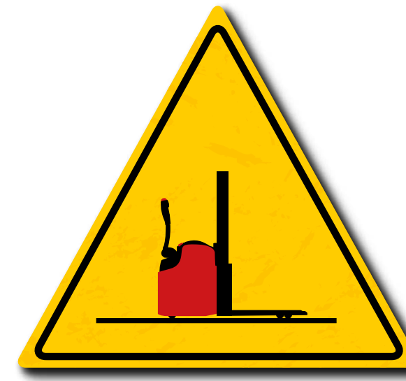
Check your equipment before use

Handling equipment is a lever improving working conditions when used properly. The Manitou Group wishes, through its REDUCE Risks program will inform you and you raise awareness of good practices for the safe use of your equipment.