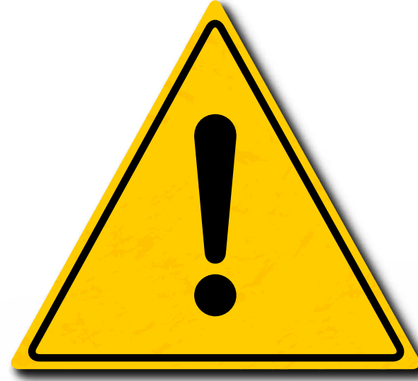
Be aware of your work environment to prevent damage