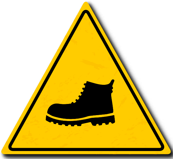
Wearing safety shoes is mandatory