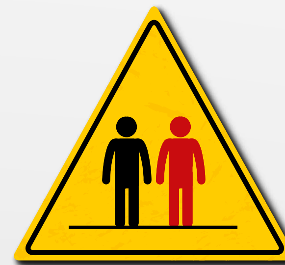
Be aware of all legal safety requirements and comply