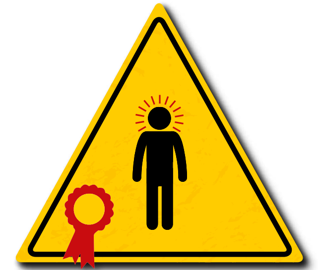
Only authorized persons may use the equipment