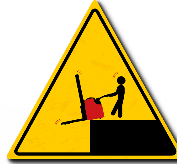
Keep a safe distance when approaching hazardous areas