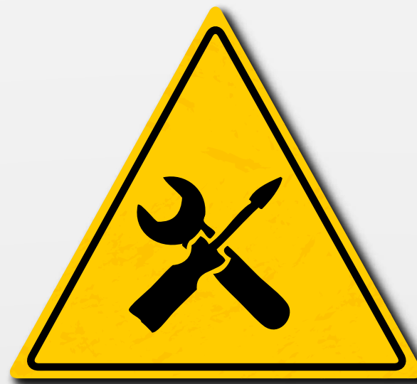
Periodic maintenance must comply with legal requirements