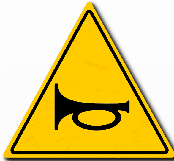
Use the horn at intersections and areas with low visibility