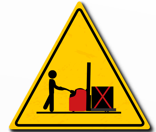
Check the stability of your load before moving