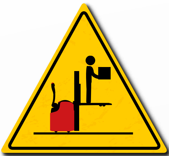
Don't climb on the equipment