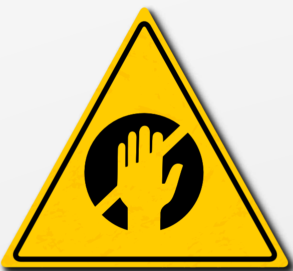
Be aware of objects, fabrics ... which can get caught in the machine..