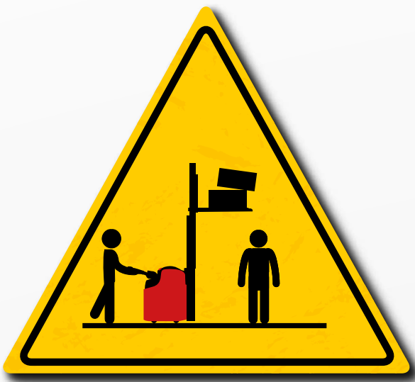
Never walk under a raised load