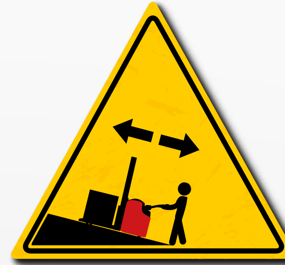
When operating on sloping ground, drive slowly with the load facing upwards