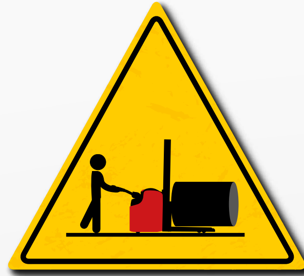
Use appropriate accessories according to the load requirement