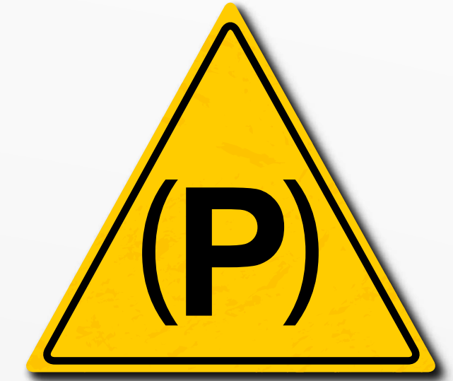
When parking respect safety rules