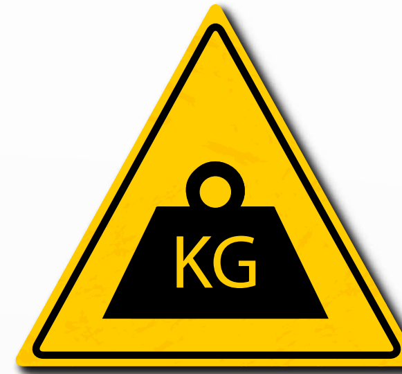
Respect the maximum capacity indicated on the load chart