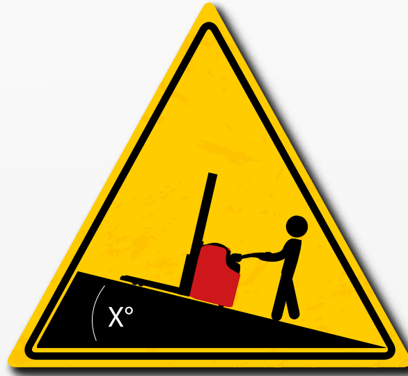
Be aware of load Gradeability