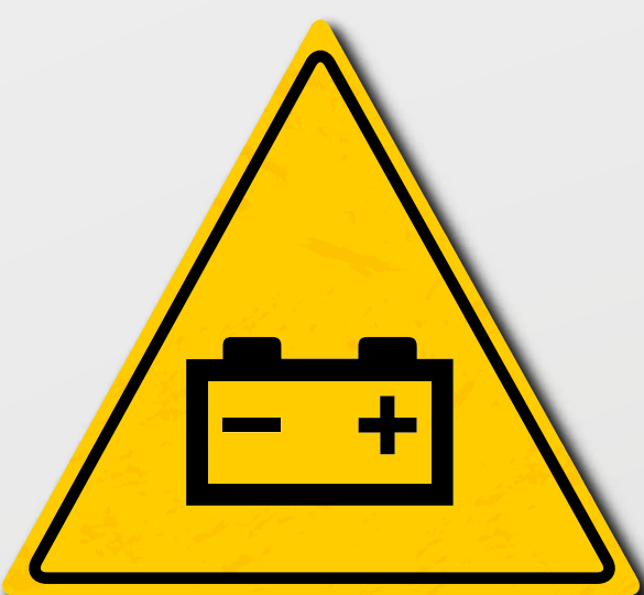
Be careful and periodically check the battery and connections