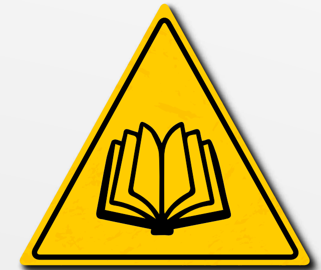
Read the instructions in the operator's manual