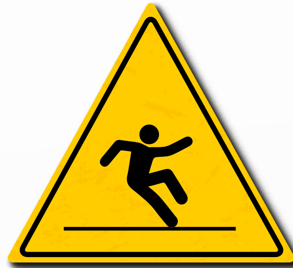
Adapt your speed on wet or greasy ground