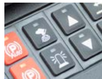
Pictogrammes universels Pour une prise en main rapide