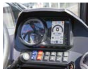
Affichage intuitif 22 langues