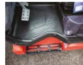
Easy Step Une visibilité optimale et sécurisée lors de la montée et de la descente du poste de conduite

Fiches d'utilisation simplifiées Disponibles dans chaque machine